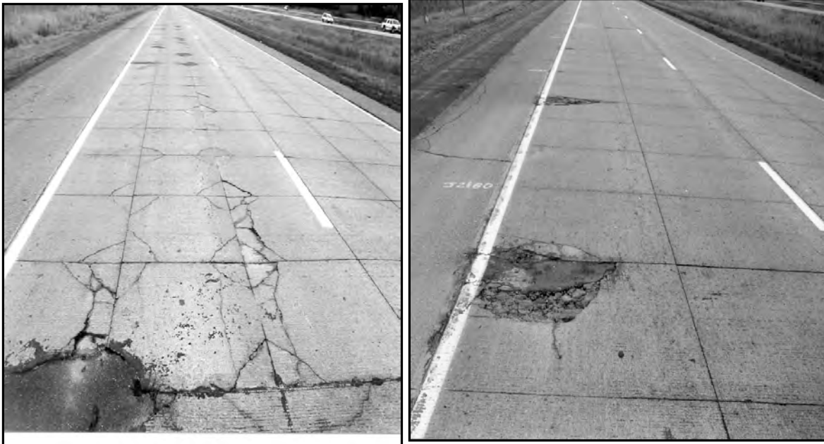
Photos 1 & 2. MnROAD UTW test Cell 94 (left photo) and test Cell 95 (right photo) after 5 million CESALs (November 2003). Driving lane is on left side in photos.

panel sizes and two thicknesses. Test cells 93 and 94, consisting of 4 foot by 4 foot panels, both demonstrated corner cracking in locations near the wheelpaths. The concentration of heavy loads near the edge of the thin panels exceeded their load capacity. Cell 93, with a concrete surface thickness of 4 inches, exhibited approximately 75% less cracks than the 3 inch thick Cell 94. Photo 1 shows the typical crack pattern experienced by Cells 93 and 94.